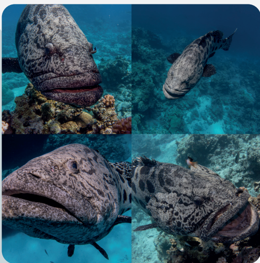
By Super Yacht Group Great Barrier Reef

Our region is experiencing record visitation at the moment with super yachts enjoying the convenience of the ideal location, high-end services and amazing destination experiences. Reports back on various areas of the Ribbon Reefs are fantastic with healthy, regenerated reef areas and a colourful abundance of marine life. Please contact us for further detailed information and to speak with our expert marine biologists who can direct you to these areas or see our online super yacht guide book for ideal private cruising grounds.